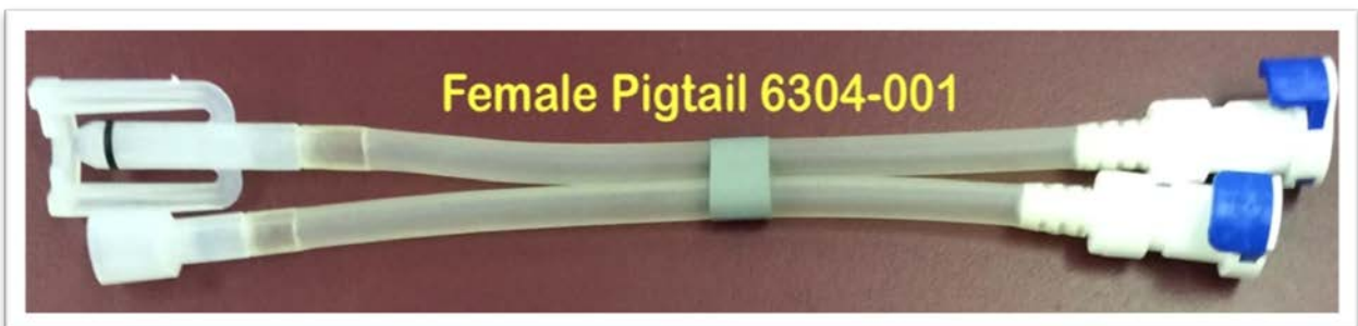
Male / Female Ends to Pump