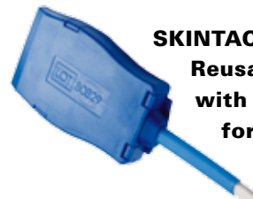
SKINTACT Cool Contact Reusable Dispersive Cable with stamped Lot Number for easy tracking (types REM and NON-REM).